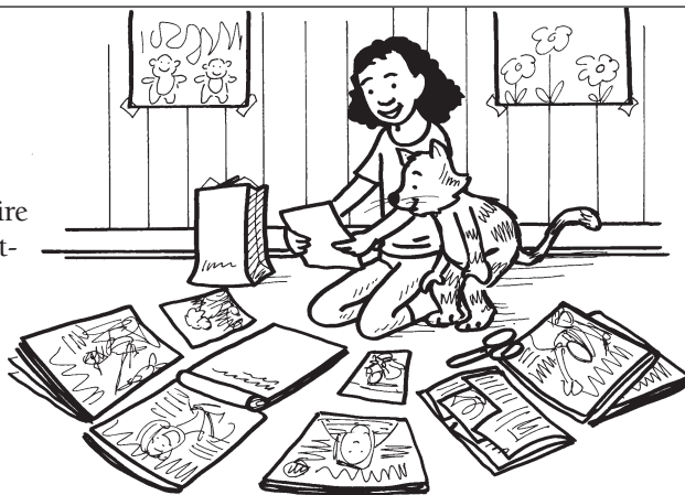
Photo walk. Go for a walk together, and let your child take pictures of scenes that might lead to a story. She could snap a photo of a fire truck speeding past with its lights flashing or of a frozen lake shimmering in the sun. At home, she

can look at the pictures and write a story about a courageous rescue or an ice hockey game.